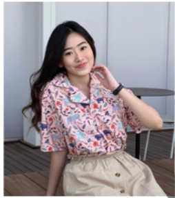
Figure 8 A Non-Influencer Model Wearing Tops made of 100% Cotton with Sumatran Animals and Plants Illustration

In addition, there are quite a lot of local brands in Jakarta that have similar products, namely clothing with original illustrations with almost similar price ranges. This indicates that Jakarta market is familiar with similar products and prices.