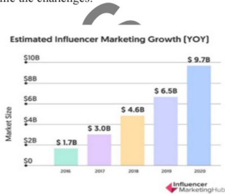
Figure 2 Estimated Influencer Marketing Growth Globally

However, from the information provided by the Influencer Marketing Hub, 55% of respondents spend funds above 10,000 US dollars or around Rp 140,000,000.00 per year for influencer marketing. Therefore, it can be concluded that the majority of companies surveyed are not micro scale. Based on Indonesian Law No. 20/2008, micro businesses are businesses that have an annual turnover of at most Rp 300,000,000.00. According to data from the Ministry of Cooperatives and Small and Medium Enterprises, micro scale businesses are the largest types of businesses in Indonesia, to develop it to a larger scale, tough competition and limited funds for marketing become the challenges.