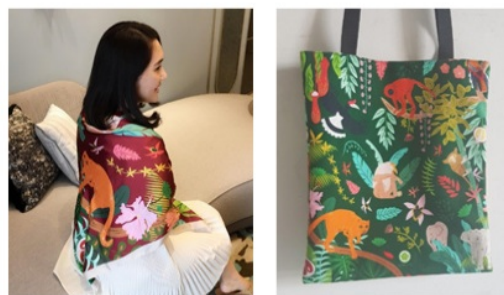
Figure 7 Kalimantan Scarf Worn by a Model (Non-Influencer) and Kalimantan Totebag