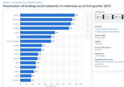
Figure 1 Statistical Data of Leading Social Networks in Indonesia

In the midst of intense business competition, new brands certainly need a strategy to increase brand awareness so that potential buyers have the ability to recognize or remember that the brand is part of certain product categories (Longwell, 1994). Based on Rakuten data (Rakuten Marketing, 2019), 65% of consumers find a new brand or product at least once a week from an influencer. Therefore, in the era of rapid use of social media as a marketing strategy, it is important for brand owners to work together with influencers to increase their brand awareness (Uzunoglu, 2014).