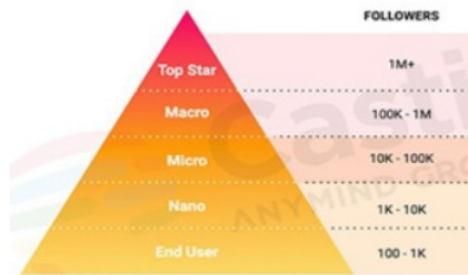
Figure 5 Types of Influencers

The selection of influencers was done in several ways, namely asking for recommendations from acquaintances who have reached influencers for their business, direct observation from Instagram by seeing circle of friends from influencers, using the Sociobuzz platform and Omnifluencer, a tool to measure the engagement rate of Instagram accounts to see the effectiveness of influencers in promoting a product. According to Jaakonmäki et al. (2017), the engagement rate is an indicator that measures the amount responses and interactions received by posting a content on social media. This interaction can be measured by the number of likes and comments that influencers get from followers when making paid posts from a brand to market the brand's products or services on Instagram (Hughes et al., 2019). If the influencer is able to create interesting content for the product, it is likely that followers will respond to the content so that the engagement rate will be high.