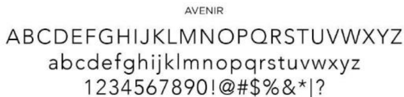
Figure 2. Avenir San Serif Typography

same look and image as what Vivree Photography has been conveying to their consumers. The design style applied by Vivree Photography is minimalism, according to Taghilooha, a minimalist design style is a design style that is able to minimize unwanted elements to provide the elements that are needed or the most necessary or basic, this is called the meaning of minimalism (Setiawan, 2021). The minimalism used by Vivree is applied to designs made for social media and websites, Minimalism that emphasizes only important elements so that the information to be conveyed is right on target. Vivree's target audience is millennials aged 22 years to 30 years, where this generation likes warm colors supported by a minimalist design style. According to Kristanto (2020), the results of a survey of researchers also revealed that the appropriate design style for millennials is a minimalist design style with black, white colors supported by sans serif typography.