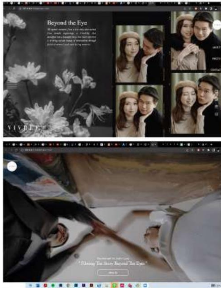
Figure 6. Vivree Website Page Design

After conducting this research, it can be concluded that the use of a website for businesses that have a visually good user interface and UI/UX with a minimalist style with warm tones and emphasis on the button icons on the website features and emphasis on font writing will make the Vivree Photography website improve the professional image and customer engagement of a business for the millennial target market aged 22 years to 30 years. The application of suggestions from sources and literature studies can also be applied from making website designs with the user face that has been written in the conclusion above. In the future, after this research, it is hoped that Vivree Photography will be able to do paid media promotions to be covered by print media and use pixieset media to maximize the gallery of the website.