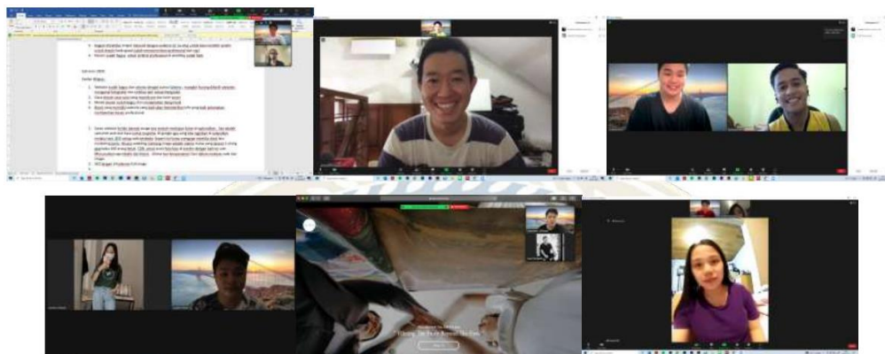
Figure 1. Online Interview Documentation