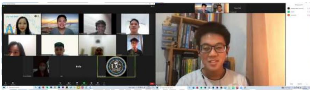
Figure 5. Online Group Discussion Documentation

Discussion about user interface UI / UX, conducted a discussion group forum that has been run where there are 15 millennials aged 22 years to 30 years old.