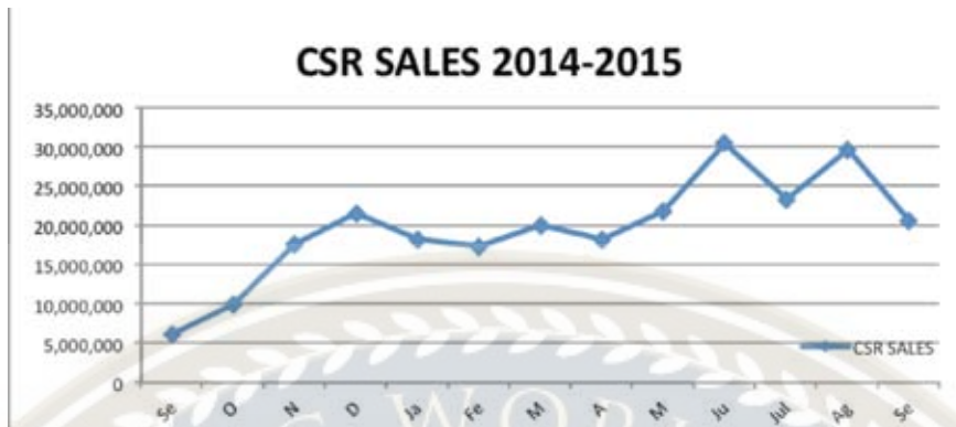
Figure 1 Sales data graphic of CSR year 2014-2015 Source: company’s internal data, 2014-2015