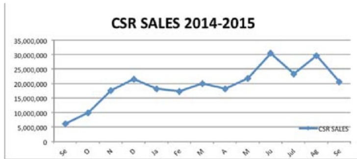
Figure 1 Sales data graphic of CSR year 2014-2015 Source: company's internal data, 2014-2015